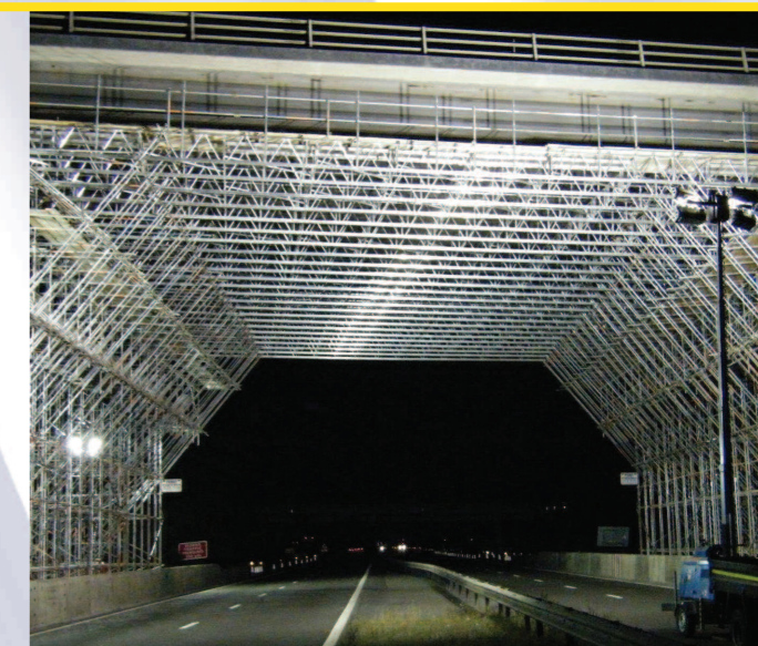
Photograph: Wadworth Viaduct.

THE COMPLETE SYSTEM FOR SUSPENDED AND BRIDGED ACCESS